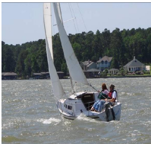
Starwind 19 Homeward bound after an exciting day of racing

During the 11:00 am skippers meeting, the higher wind conditions were discussed and the start time was delayed an hour to see if the wind would abate as projected by forecasts. Two two-nautical-mile courses were used by the racers, both with the start-finish line at the center of the CRBA Olympic circle: