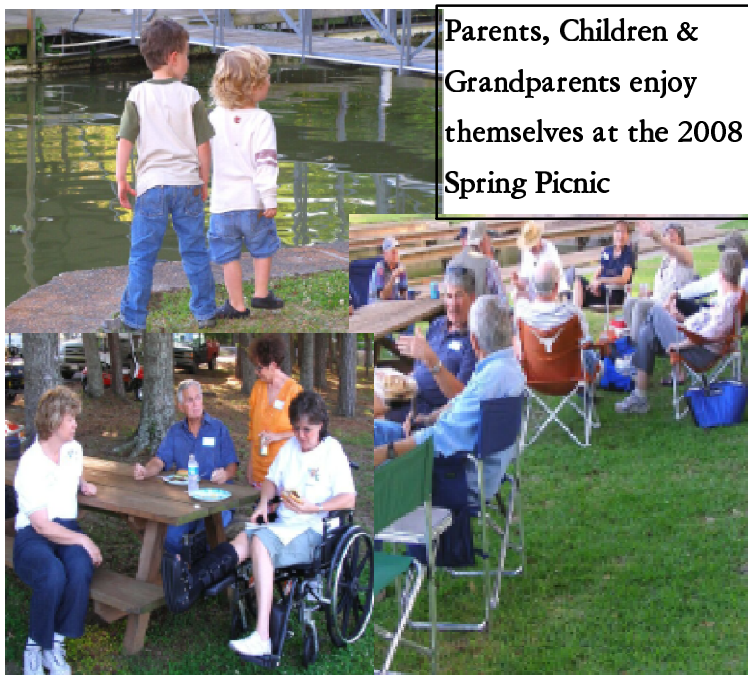
Parents, Children & Grandparents enjoy themselves at the 2008 Spring Picnic